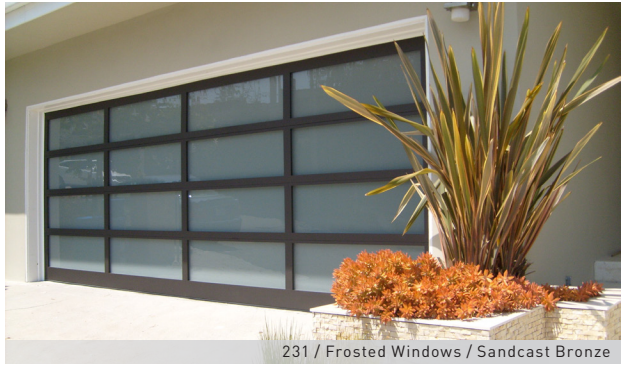
231 / Frosted Windows / Sandcast Bronze

Legend: ∞ - Lifetime Warranty† 5 - 5 Year Warranty† 3 - 3 Year Warranty† 10 - 10 Year Warranty†