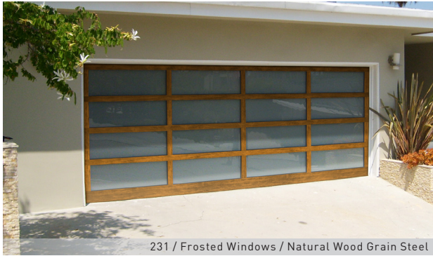
231 / Frosted Windows / Natural Wood Grain Steel